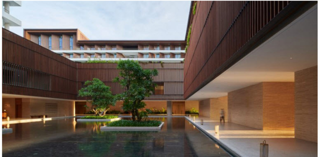
Public spaces were arranged around the courtyard

“The lobby becomes a garden landscape with a floating lantern hovering above that allows a gentle light to filter in, and with the soft breeze that flows through, guests are immediately transported to a relaxed state of mind for appreciating the slow pace of island life,” said Neri&Hu.