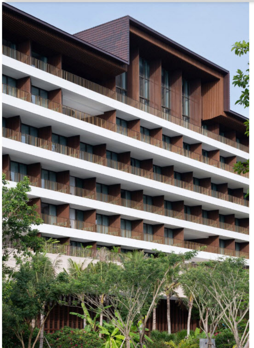
Dark wood walls separate the guest room balconies

Guest room balconies overlooking the nearby sea feature angled dark wood walls that contrast with the white floor slab structure, creating a rhythmic facade.