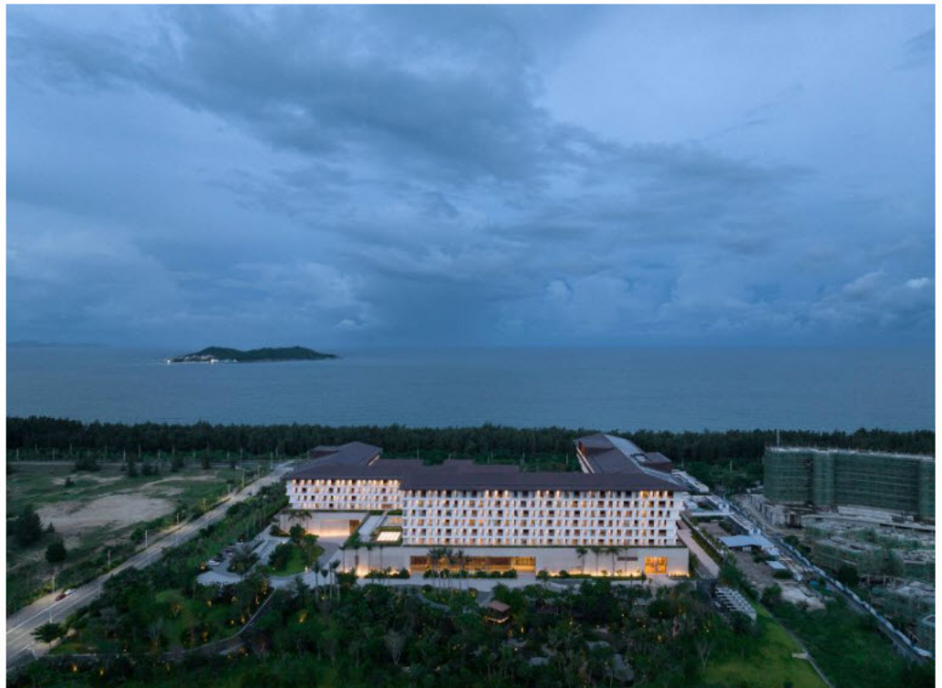
The hotel overlooks the South China Sea

Located in Haitang Bay , Neri&Hu designed two L-shaped buildings with wood-clad upper levels containing 343 guest rooms perched on top of a masonry base, where the lobby, reception, dining hall and event spaces are located.