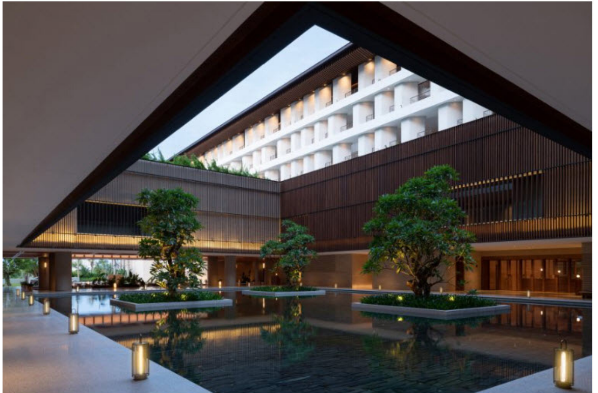
Neri&Hu designed a “water courtyard” wrapped by two L-shaped buildings

“At every given opportunity the design tries to embody the genius loci of Hainan, to blend elements from the island’s collective memory, culture and natural features,” said Neri&Hu.